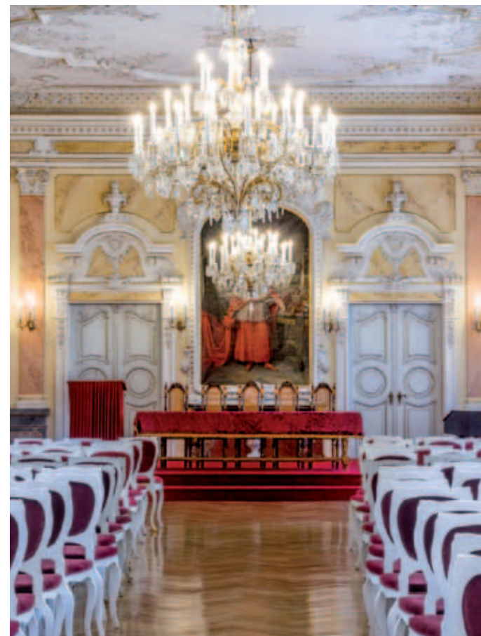
One of the ceremonial halls of the Archbishop's Palace in Olomouc.

Bishop Karl II von Liechtenstein-Castelcorn devoted great effort to economic and cultural restoration of the land, and enhancement of the Bishop's residences. Under his episcopate the Bishop's residences in Olomouc and Kroměříž were rebuilt.