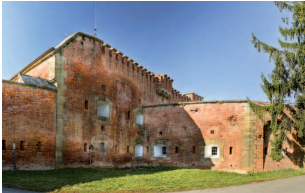
Part of the rim of the fortresses on the perimeter of Olomouc.

While for decades the individual elements of the defence system were beyond the reach of the public, as they mostly belonged to the military, recently they have become more and more a part of the social life of the town. The Crown Fortress, a Baroque fortification close to the city centre, hosts social events more and more frequently; but so do the other fortresses, for example in Křelov or Radíkov. In recent years, people have