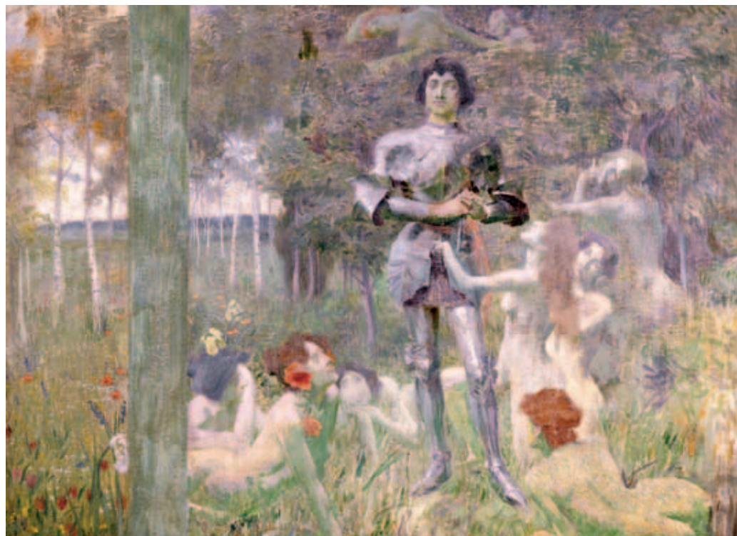
Jan Preisler, Series about Adventurous Knight, 1897-1898.

A part of the institution is the Archdiocesan Museum with its exposition on spiritual art culture of the 12 th to 18 th centuries, an exhibition of European importance. It is located in the rebuilt national cultural monument Premyslid Castle, one of the oldest continuously inhabited sites in Central Europe. In 1306, the last king of the Premyslid dynasty, Wenceslas III, was assassinated here. The permanent exposition called For Glory and Praise of-