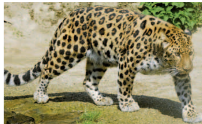
Leopards will get a super modern pavilion.

The Olomouc Zoo is so attractive because of the extraordinary amount of species kept (app. 350) and the number of animals (over 1700 heads). People enjoy visiting the pavilion with beautiful sea aquariums, big feline runs, ex-