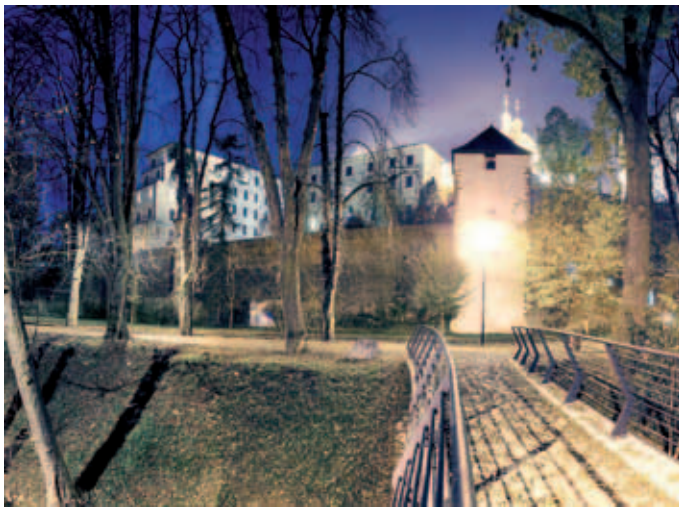
The walls surround a large part of the historic town center.

May, June, September, October – Saturday and Sunday from 11am to 5pm July and August – Wednesday to Sunday from 11am to 5pm Phone: +420 777 135 001, www.pevnost-radikov.cz