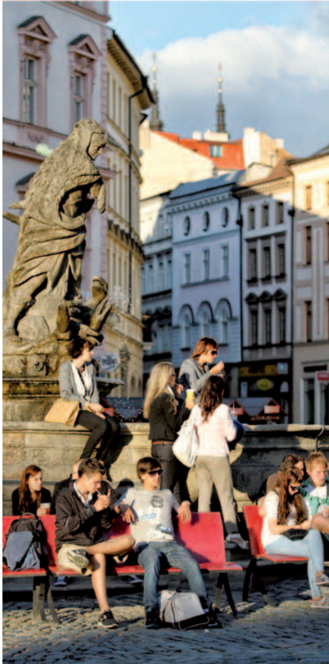
A pleasant life among the sights in Olomouc.

This year the Statutory City of Olomouc provided a grant contribution to the Olomouc Baroque Festival which will take place from the 8 th to 19 th July. Besides listening to Baroque opera, there will be an evening tour of the Chapel of St John Sarkander and a climb to the tower of the St Micha-