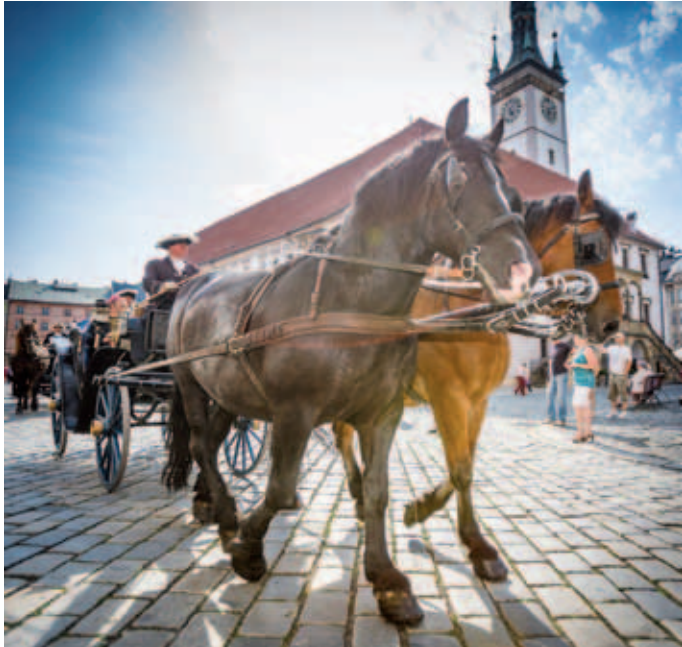
Part of the celebrations is the parade to honour St Paula.

City Festival is a great opportunity to explore the town centre, its streets, picturesque corners, as well as magnificent squares, while enjoying something from the large selection of the festive programme.