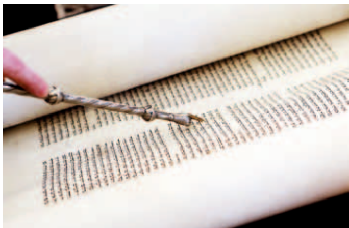
The Jewish Community Olomouc, e-mail: kehila@kehila-olomouc.cz , tel.: +420 585 223 119, 608 318 874, www.kehila-olomouc.cz