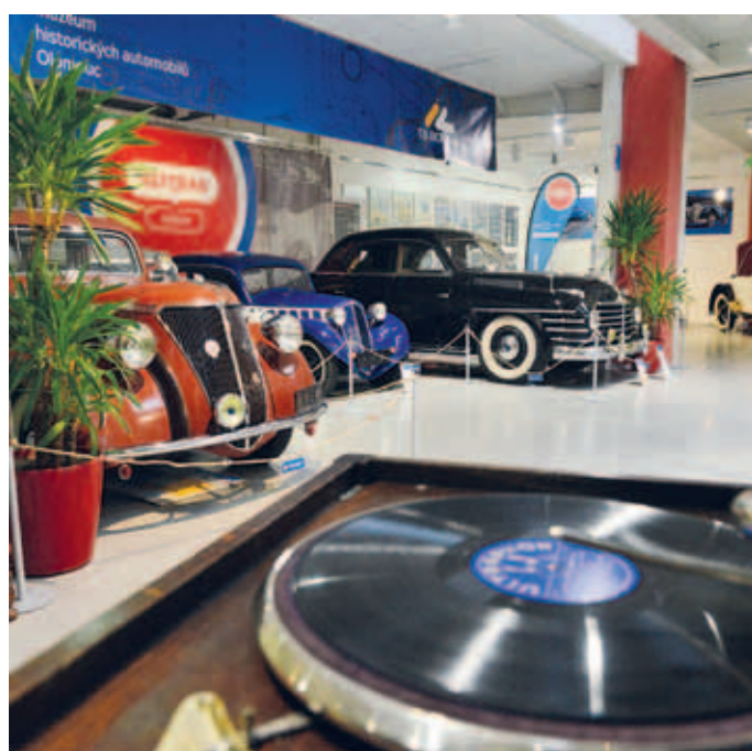
Vintage cars, historical gramophones and radios boast unmistakable magic.

"Veteran Arena has extended the family of Olomouc museums in an amazing way. The exhibits on display must enthuse everybody, as they are simply beautiful," comments