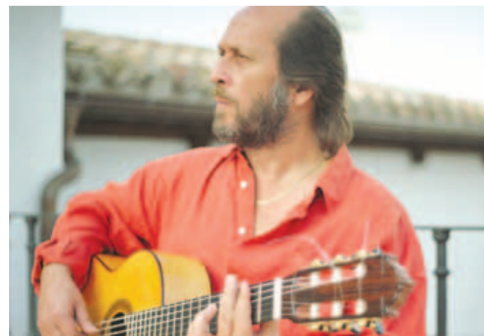
Paco de Lucía is the greatest guitarist of flamenco style in the world.

COLORES FLAMENCOS OLOMOUC | 25.–28. 7. CONCERT PACO DE LUCÍA | 26. 7. Horní náměstí (Upper Square) in Olomouc www.flamencool.cz