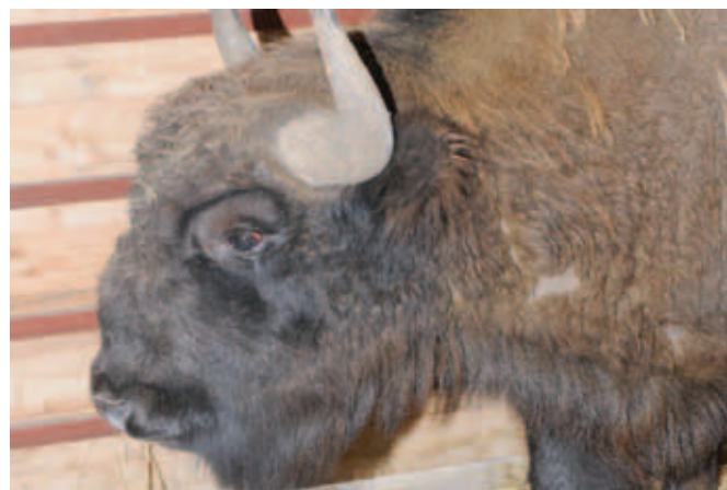
A bison is one of the stars of Eurasian safari.

As close to the animals as possible. This is the motto which rules the Olomouc Zoo while building new parts of the grounds. This year's visitors to one of the largest Czech and Moravian zoos can watch Amur Leopards up close in unique surroundings, lovely big cats which are on the brink of extinction in the wild. However, they thrive in Olomouc and repeatedly breeders have been able to enjoy births of new cubs in the past years. Another super attractive novelty is the Eurasian safari where visitors can watch up close – from a small train of course – e.g. elk and bison, namely huge artiodactyls, which used to live in our forests hundreds of years ago too. "We would like to open both these new parts at the